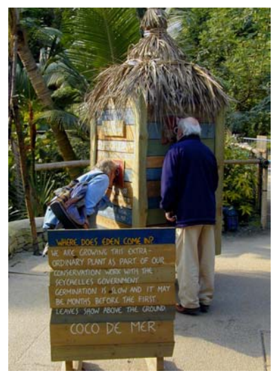
The Coco de Mer Exhibit in the Humid Tropics Biome at the Eden Project.

Eden Project core funds have been used for several additional outputs to this Darwin Project. Eden has contributed £30,000 to the development of the Tropical Islands exhibit on site in the Humid Tropics biome of which the Seychelles Darwin Project occupies 40%.