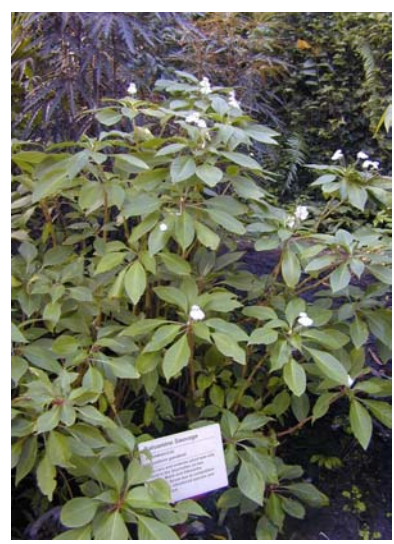
Impatiens gordonii growing in the Tropical Islands Exhibit at the Eden Project.

This year in collaboration with the University of Reading, Eden featured some of the Seychelles Darwin work in an exhibit for the Chelsea Flower Show for which it received a Silver Gilt Medal. The total cost of the Chelsea flower show was £10,000 and included 5,000 educational handouts and 10 000 promotional postcards for the conservation of the endemic Medusagne Oppostifolia (Jelly Fish Tree).