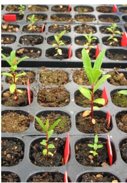
Seedlings of Medusagyne Oppositifolia growing at the Eden Project's Watering Lane Nursery.

Following our field work on Impatiens gordonii we have been able to classify this species as critically endangered. During the training sessions this species was identified as a primary candidate for a species recovery programme. Further work on this species has revealed that one of the populations on Mahé is displaying a deformed flower spur, possibly the result of genetic depression. This has serious consequences for the sexual reproduction of the population. In addition many of the plants displayed stem roots a form of clonal recruitment that may exacerbate detrimental genetic characteristics. These are serious issues for the recovery of particular populations of this species but the investigation and decision making processes that forms part of this work is proving to be an invaluable example in the learning and teaching experience.